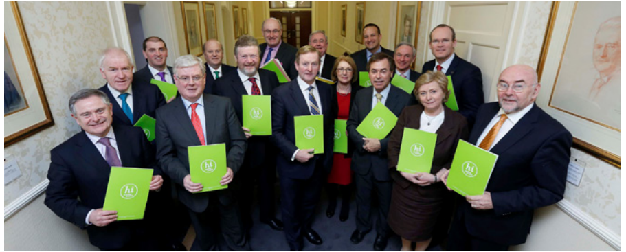
Government of Ireland, March 2013.

In recent years the alcohol industry has attracted a range of entrepreneurs attracted by an expanding marketplace for alcohol products both domestically and internationally. Many of these fledgling enterprises, specifically located in under-developed regions and localities, have sought and received significant seed capital from the Exchequer through numerous state agencies. A recent Parliamentary Question (PQ1496/18) to the Minister for Business; Enterprise and Innovation, established that between 2015-2017: Enterprise Ireland, and Local Enterprises Offices had awarded €3.82m to fledgling alcohol enterprises, including €1.005m in equity funds.