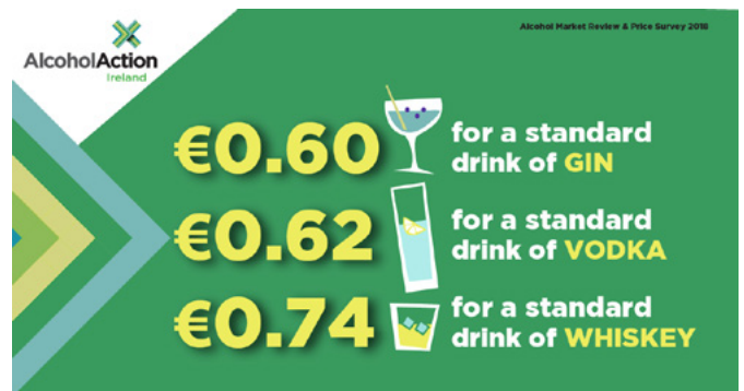
Figure 3: Affordability of Standard Drink: Gin/Vodka/Whiskey