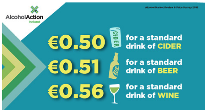
Figure 2: Affordability of Standard Drink: Cider/beer/Wine

With evidence of rising consumption patterns and enhanced affordability, Alcohol Action Ireland urges that Budget 2019 would at best not seek to reduce existing excise duties on alcohol products, and/or, give due consideration to re-adjusting excise duties on alcohol products to diminish the enhanced affordability of alcohol products to regain the typical household weekly expenditure on alcohol products of 2009-10.