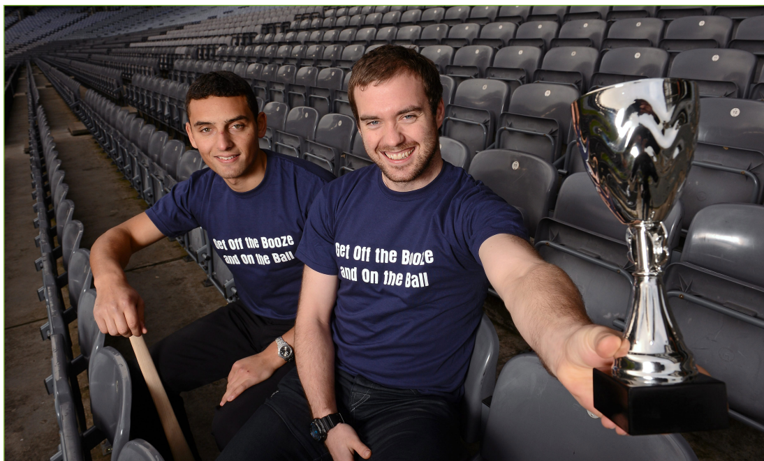
The GAA promoting their "Off The Booze, On The Ball" campaign.