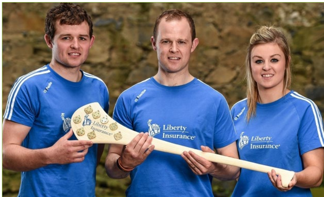
Liberty Insurance became a sponsor of the All-Ireland Hurling and Camogie Championships in 2013.

Previously, the Joint Committee on Arts, Sport, Tourism, Community, Rural and Gaeltacht Affairs recommended "the sourcing of sponsorship for sport outside of the alcohol industry: the correlation between the onset of drinks sponsorship and the rapid rise in alcohol consumption in this country is too strong to be ignored." (70)