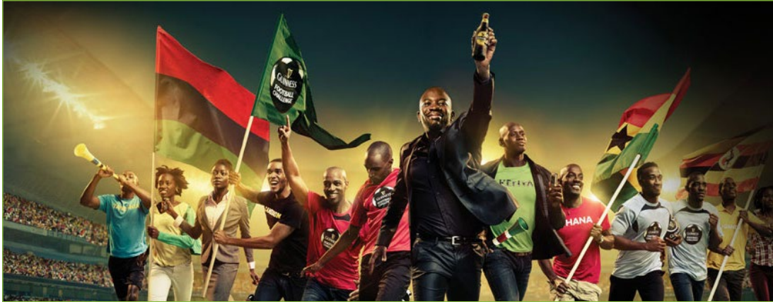
"The Guinness Football Challenge" used "the fervent love of football" to drive sales for Diageo in Africa. Source: http://bit.ly/1rMlcKi

The CEO of Anheuser-Busch "identified four priorities in the company's quest to enhance profits by increasing overall consumption and sales: improve the image and desirability of beer; keep beer fun and social; increase beer occasions; and improve retail sales. Sponsorship of sports fits well with all four of these strategies and so has become the company's primary promotional tool in most of its markets." (9)