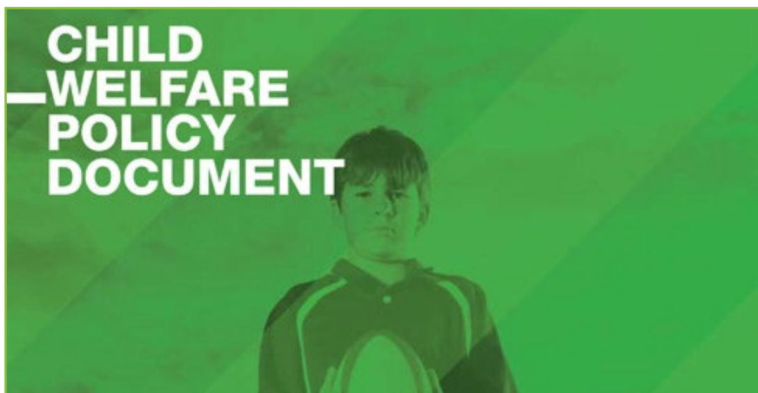
The IRFU Child Welfare Policy Document warns that alcohol advertising can be misleading for children and make awareness of the pitfalls of alcohol consumption difficult.

The impact of alcohol marketing, including sponsorship and advertising, on the beliefs and behaviour of Irish children is clearly not lost on the very same sporting organisations accepting alcohol sponsorship.