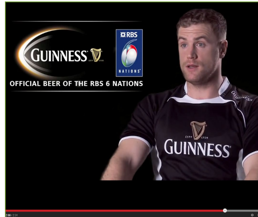
Ireland rugby international Jamie Heaslip featuring in the Guinness “Made of More” campaign.

‘Sponsorship activation’ carried out by the sponsor then uses a wide range of online and offline advertising, sales promotion and PR techniques to leverage this sponsorship to deliver tangible benefits to the sponsor, particularly an increase in sales. Sporting endeavour at the highest level reflects some of those things to which many people aspire and identify with; talent, courage, fame, charisma, national pride and admiration. The emotional connection many sports fans feel to their club, county or country extends to those who ‘support’ or ‘partner’ their endeavours.