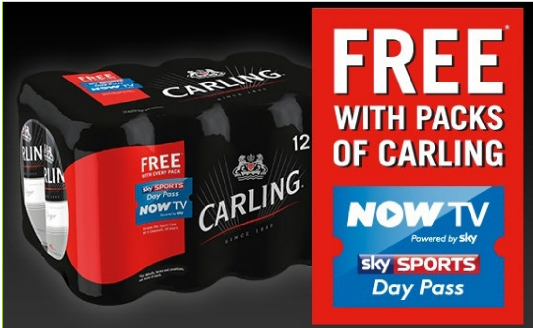
A Sky Sports promotion made available through purchases of Carling product.

There is also a clear desire to increase the amount being drunk. Professor Hastings notes that, “debates about advertising inevitably raise the question about whether effects are limited to brand share or affect consumption in general: is the main effect of alcohol marketing to encourage brand share and switching, or does it also expand the market and increase per capita consumption? The documents suggest that alcohol producers seek to do both with their advertising. The industry’s interest in young people and recruiting the next generation to alcohol, as discussed in Section 1, speaks to a faith in its capacity to grow the market. This hope is encapsulated in the title of the Smirnoff document ‘Introducing next generation growth for vodka in the On-Trade’ .”