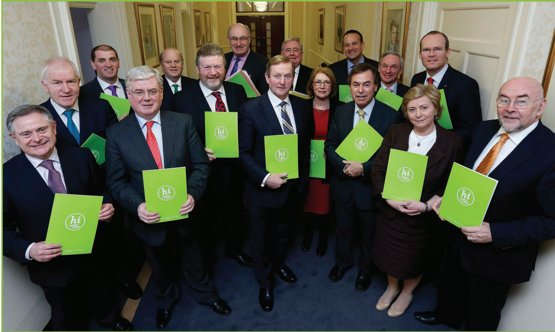
The Cabinet endorses Healthy Ireland , March 2013

Alcohol sponsorship of sport is the keystone for a wide range of alcohol marketing activity in Ireland. An array of marketing activities are used to leverage the link between alcohol, sports and elite athletes, which ultimately drives consumption of alcohol. Advertising “activates” the sports sponsorship to increase sales.