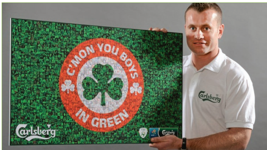
Ireland goalkeeper Shay Given featuring in a Carlsberg promotion, ahead of Euro 2012.

Even if alcohol sponsorship were worth the greatly overestimated €35 million, it’s worth noting this would still see alcohol sponsorship of sports worth less than 1% of the estimated €3.7 billion annual cost of alcohol-related harm to the State. (67)