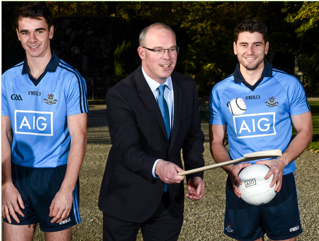
AIG became the principal sponsor of Dublin GAA, Ladies Football and Camogie in 2013. Source: http://bit.ly/1rMINeU

whose corporate values are ultimately misaligned with the ethos of sport. (9) Some sporting organisations have already made significant progress in this regard, proving that it can be done.