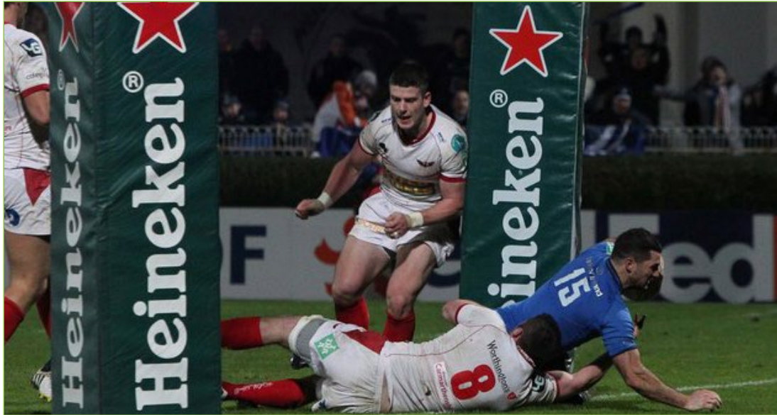
Heineken branding features prominently during the action in a Heineken Cup clash.

Young Irish people are exposed to a huge amount of alcohol marketing, of which sports sponsorship is a key part. Every day, in numerous ways and through numerous media, children and young people are continuously exposed to positive, risk-free images of alcohol and its use.