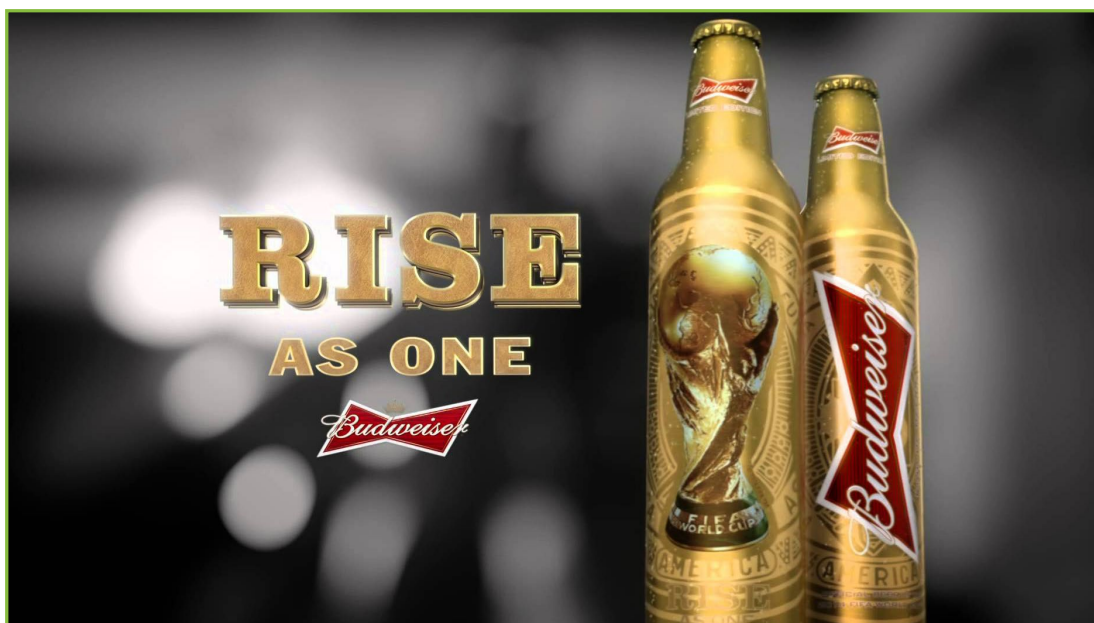
Budweiser are one of the main sponsors of the FIFA 2014 World Cup.

The first Strategic Task Force on Alcohol report was published one month before the 2002 FIFA World Cup and the industry was anticipating a sponsorship ban then. This issue has been on the agenda for at least 12 years and legislation is long overdue.