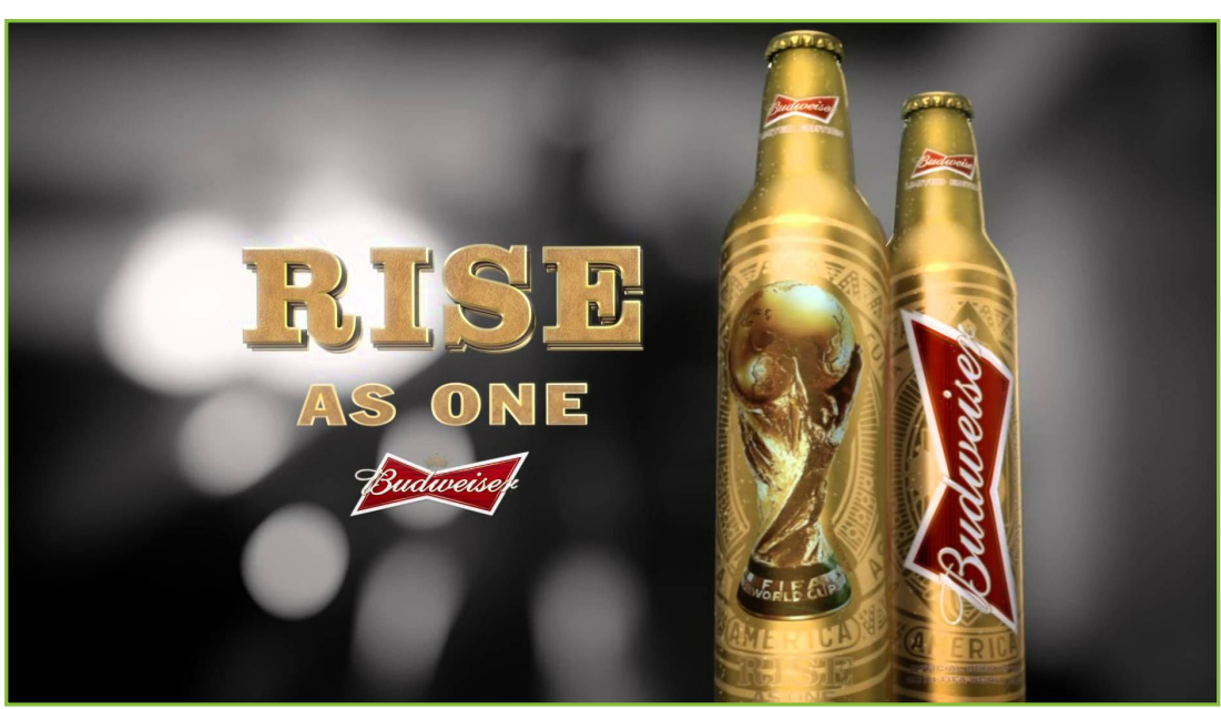
Budweiser are one of the main sponsors of the FIFA 2014 World Cup.

The first Strategic Task Force on Alcohol report was published one month before the 2002 FIFA World Cup and the industry was anticipating a sponsorship ban then. This issue has been on the agenda for at least 12 years and legislation is long overdue.