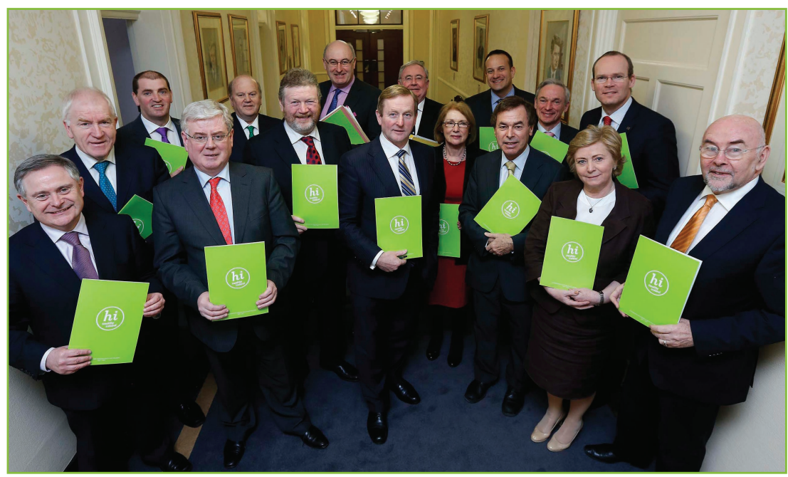
The Cabinet endorses Healthy Ireland, March 2013

Alcohol sponsorship of sport is the keystone for a wide range of alcohol marketing activity in Ireland. An array of marketing activities are used to leverage the link between alcohol, sports and elite athletes, which ultimately drives consumption of alcohol. Advertising "activates" the sports sponsorship to increase sales.