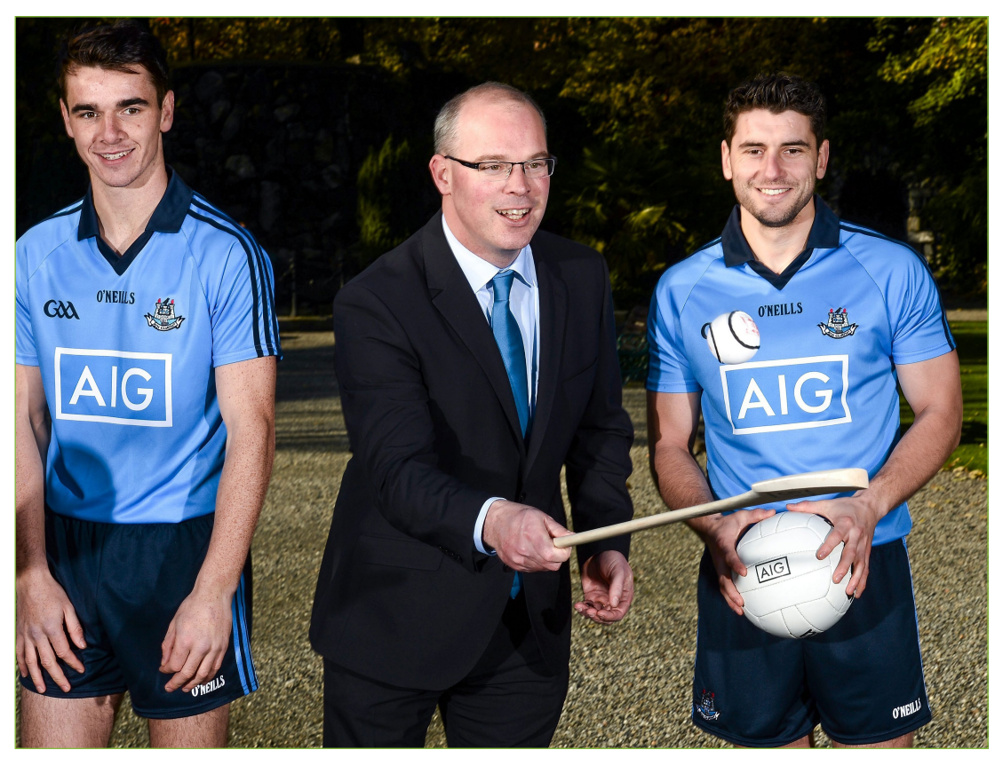
AIG became the principal sponsor of Dublin GAA, Ladies Football and Camogie in 2013.

whose corporate values are ultimately misaligned with the ethos of sport. <sup>(9)</sup> Some sporting organisations have already made significant progress in this regard, proving that it can be done.