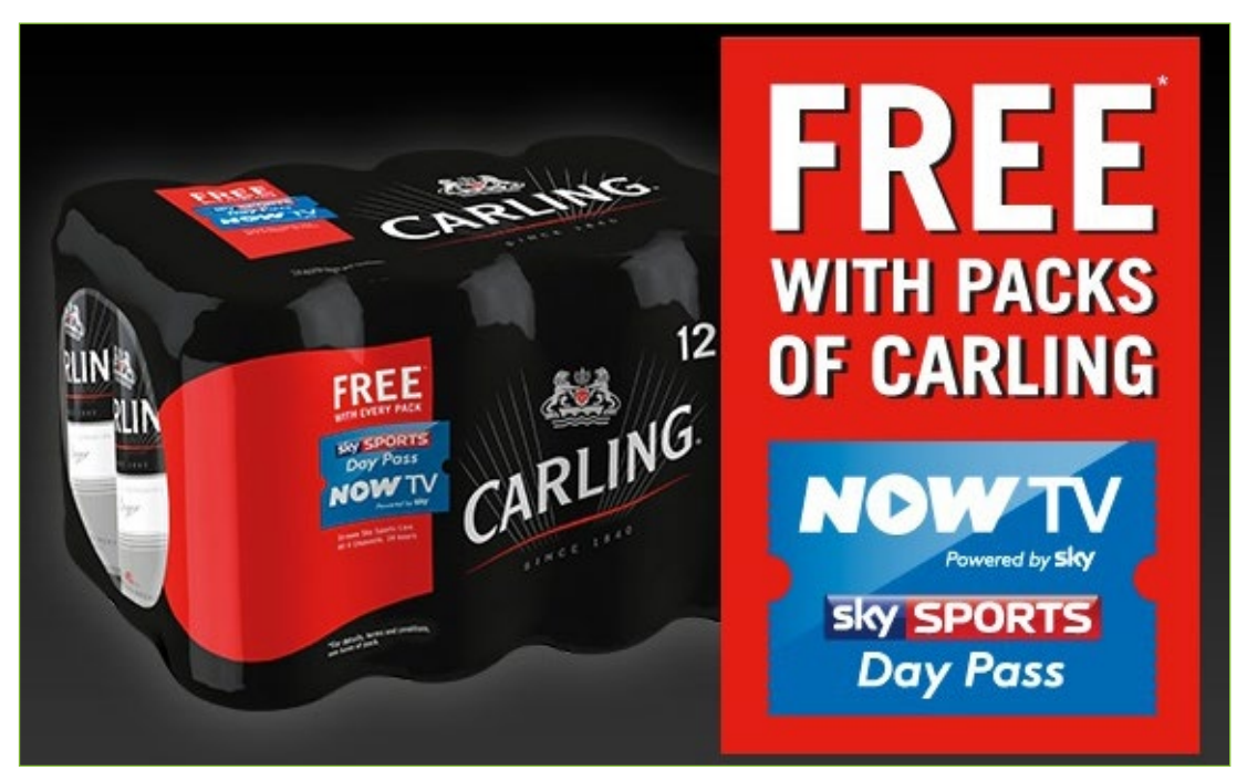
A Sky Sports promotion made available through purchases of Carling product.

There is also a clear desire to increase the amount being drunk. Professor Hastings notes that, "debates about advertising inevitably raise the question about whether effects are limited to brand share or affect consumption in general: is the main effect of alcohol marketing to encourage brand share and switching, or does it also expand the market and increase per capita consumption? The documents suggest that alcohol producers seek to do both with their advertising. The industry's interest in young people and recruiting the next generation to alcohol, as discussed in Section 1, speaks to a faith in its capacity to grow the market. This hope is encapsulated in the title of the Smirnoff document 'Introducing next generation growth for vodka in the On-Trade'.