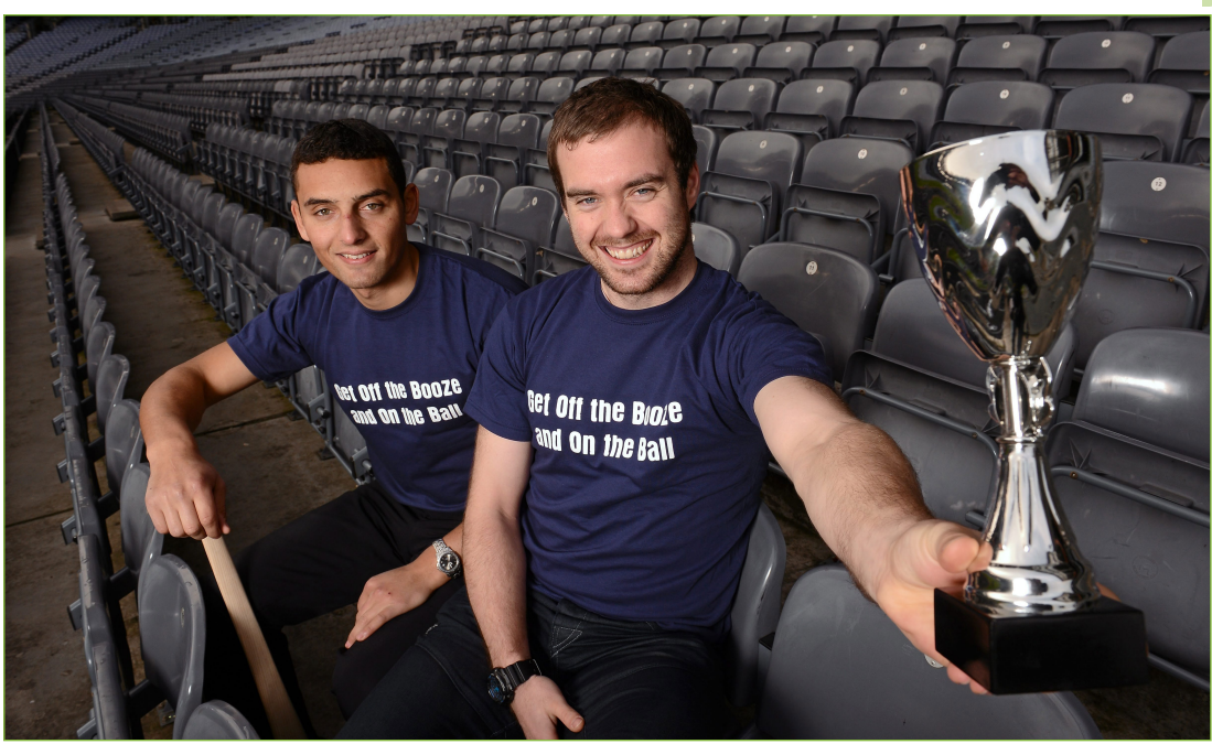
The GAA promoting their "Off The Booze, On The Ball" campaign. Source: http://bit.ly/lujbe0G