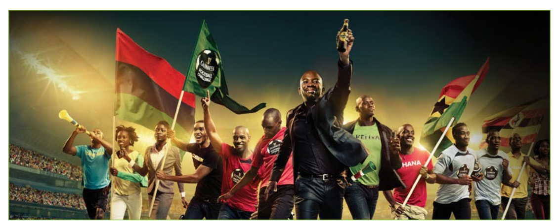
"The Guinness Football Challenge" used "the fervent love of football" to drive sales for Diageo in Africa.

The CEO of Anheuser-Busch "identified four priorities in the company's quest to enhance profits by increasing overall consumption and sales: improve the image and desirability of beer; keep beer fun and social; increase beer occasions; and improve retail sales. Sponsorship of sports fits well with all four of these strategies and so has become the company's primary promotional tool in most of its markets." (9)