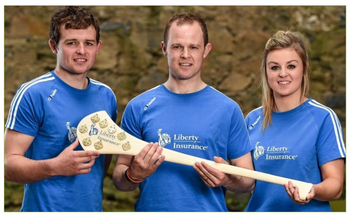
Liberty Insurance became a sponsor of the All-Ireland Hurling and Camogie Championships in 2013. Source: <a href="http://bit.ly/lujbywn">http://bit.ly/lujbywn</a>

Previously, the Joint Committee on Arts, Sport, Tourism, Community, Rural and Gaeltacht Affairs recommended "the sourcing of sponsorship for sport outside of the alcohol industry: the correlation between the onset of drinks sponsorship and the rapid rise in alcohol consumption in this country is too strong to be ignored." (70)