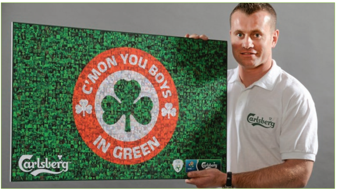
Ireland goalkeeper Shay Given featuring in a Carlsberg promotion, ahead of Euro 2012.

Even if alcohol sponsorship were worth the greatly overestimated €35 million, it's worth noting this would still see alcohol sponsorship of sports worth less than 1% of the estimated €3.7 billion annual cost of alcohol-related harm to the State.<sup>(57)</sup>