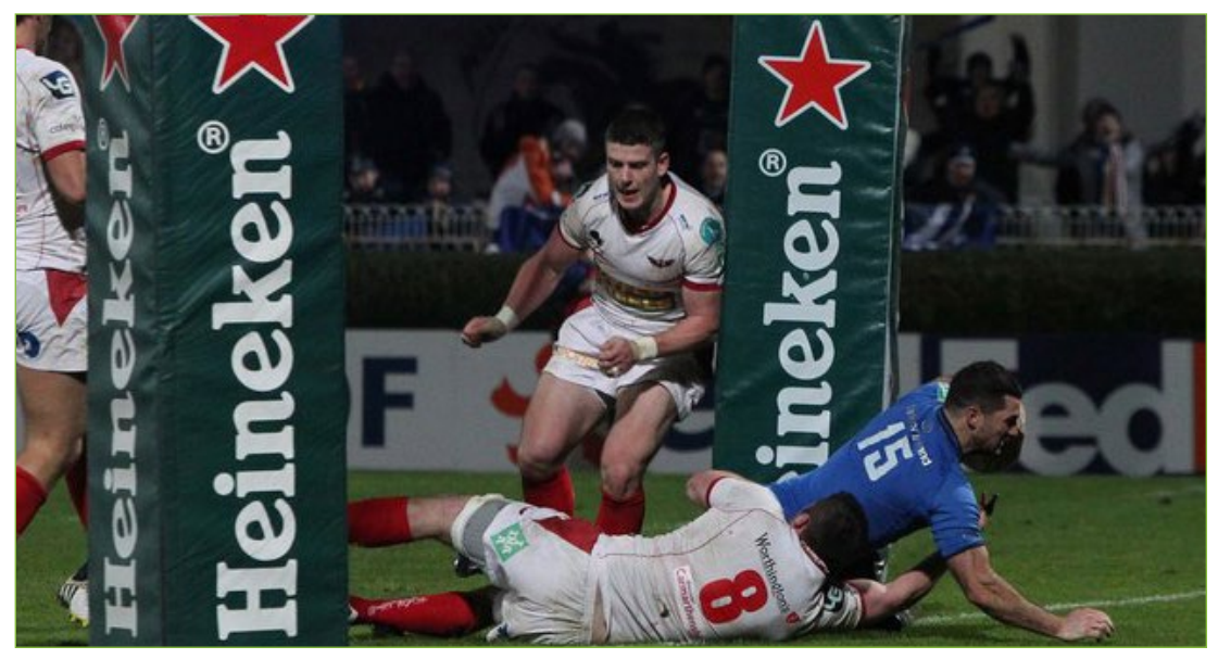
Heineken branding features prominently during the action in a Heineken Cup clash.

Young Irish people are exposed to a huge amount of alcohol marketing, of which sports sponsorship is a key part. Every day, in numerous ways and through numerous media, children and young people are continuously exposed to positive, risk-free images of alcohol and its use.